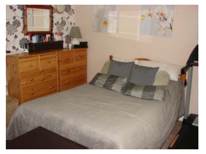
BEDROOM: (Approx 2.59m – 2.87m) A further bedroom to the rear with CH radiator.

A ground floor master bedroom to the rear with CH radiator and TV point.