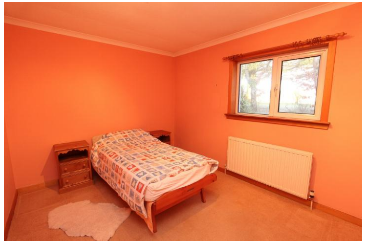
BEDROOM 3: A further double bedroom to the rear.