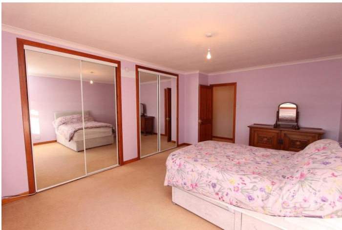
BEDROOM 2: A spacious double bedroom to the side with built-in wardrobes.