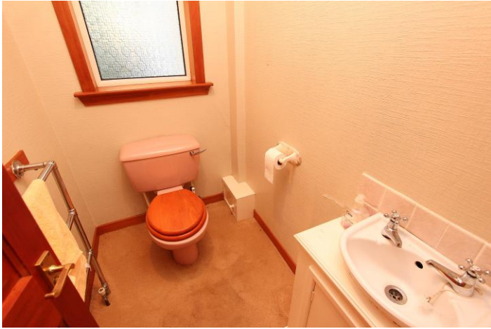
WC: Fitted with WC and WHB. Heated towel rail.