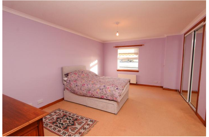
Further bedroom 2 image