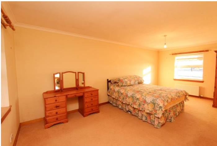
BEDROOM 1: A spacious double aspect, double bedroom to the rear.